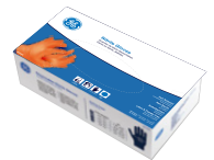
50 Pieces Box