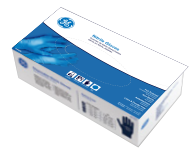
100 Pieces Box