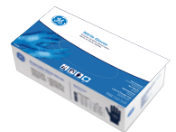
100 Pieces Box