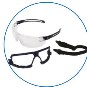
Include Removable Protective Foam Gasket and Adjustable Headband